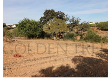
4720 Land Area (m²)